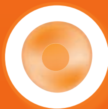
ANTI MÜLLERIAN HORMONE (AMH)