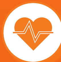
BRAIN NATRIURETIC PEPTIDE (BNP)