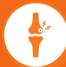
BONE MARKERS (SERUM)