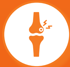
BONE MARKERS (SERUM)